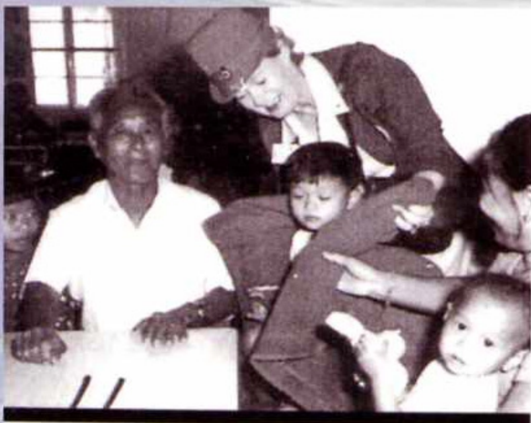
Wacol Migrant Centre - 27 August 1975