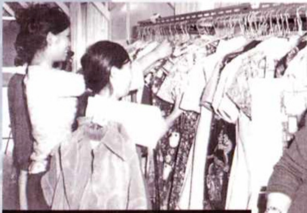
Wacol Migrant Centre - 27 August 1975

The refugees were most often visited by a handful of the Vietnamese ladies who were married to Australians, as well as a few Vietnamese Colombo Plan students in Brisbane who were left behind after the fall of South Vietnam. These compatriots offered great assistances and comfort to the newcomers. There were many social and communal occasions and there was a strong sense of unity. The refugees were also introduced to new culinary experiences, some of which, such as lamb, represented an acquired taste.